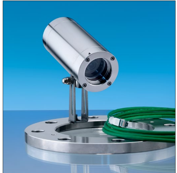
VISULEX camera K55-HD mounted on a flange with a hinged bracket